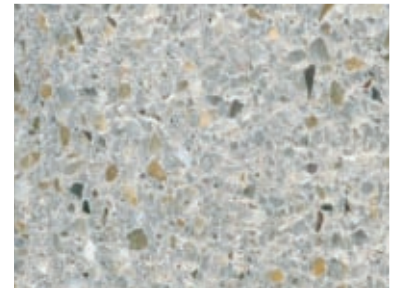
grey (Duna C/D4)